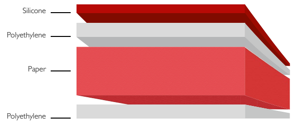
SILICONISED RELEASE LINER